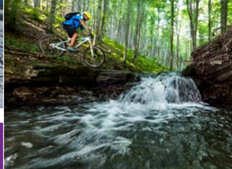
12 - Jičinka Creek, Veřovické vrchy

View towers present especially attractive places to go for day trips. In Horní Vsacko, there are view towers on the mountains of Miloňová, Sůkenická and Ztracenec. In Rožnovsko, there is a newly renovated view tower by architect Jurkovič in Rožnov pod Radhoštěm and two towers on mountain tops in Bůřov and Velký Javorník. To enjoy magnificent panoramic views, however, there is no need to go to a view tower. Viewpoints to see the beautiful country abound.