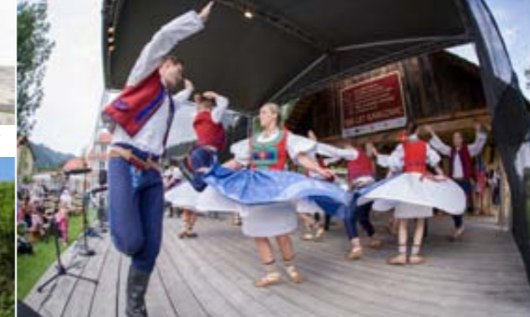
6 - 300-Year-Anniversary Fair in Velké Karlovice

Markets, fairs, festivals, shows, exhibitions, lectures and theatre plays - a wide range of cultural events takes place in Wallachia all year round.