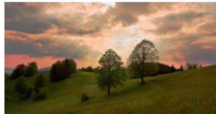
2 - Galovské lúky, Huslenky