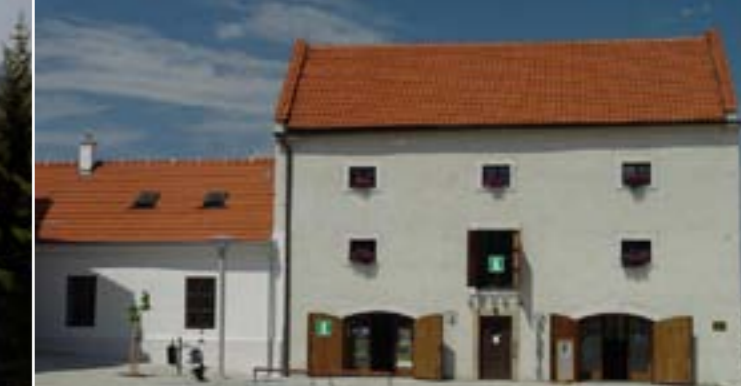
18 - Information Centre, Valašské Meziříčí

Accommodation services are plentiful and diverse. They include chalets, houses-for-rent and hotels including family pensions or large five star venues. Restaurants and bars typically offer local specialties.