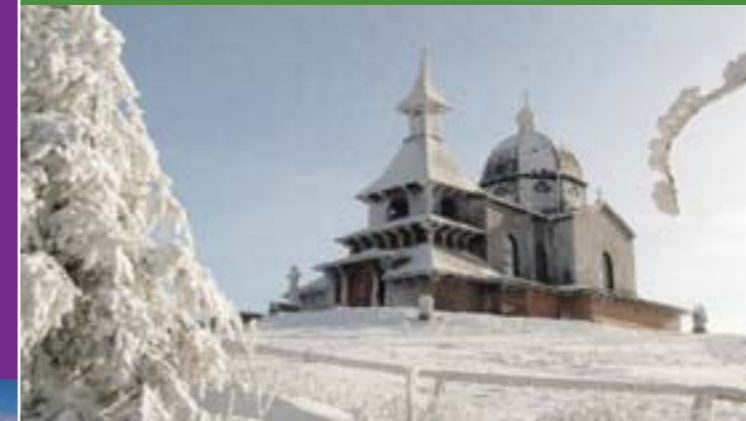
3 - A timbered church dedicated to the saints Cyril and Methodius, Mt. Radhošť

The valuable cultural heritage of the region includes monuments to local traditions, particularly in the area of architecture. In most municipalities, historical churches, bell towers, chapels, museums and traditional timbered houses have been preserved.