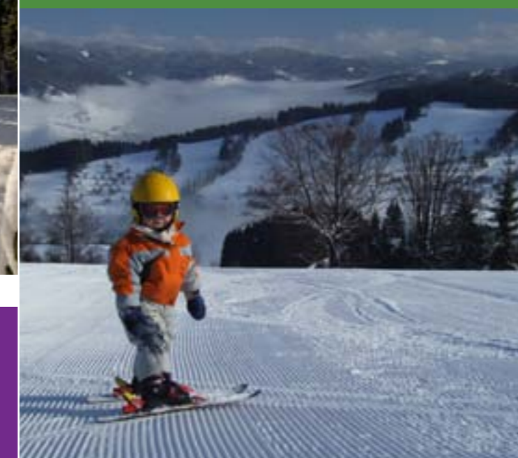
17 - Vranča ski lift, Nový Hrozenkov

Local ski resorts operate ski slopes ranging in difficulty. All slopes are equipped with surface ski lifts. Velké Karlovice, Nový Hrozenkov, Horní Bečva, Pustevny and Soláň are the largest ski resorts but many villages have surface ski lifts as well. Pustevny, Rališka and Kohútka centres operate chair ski lifts.