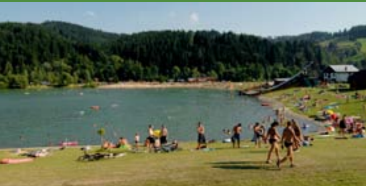
8 - Lake Na Stanoch, Nový Hrozenkov

Destination Wallachia offers excellent opportunities for outdoor enthusiasts and history lovers alike. Traditional architecture and folklore, unique and well-preserved countryside and a tourism infrastructure attract many visitors. In the summer, Wallachia is a prime destination for bicycling and hiking. In the winter, downhill and cross-country skiing and snow-shoeing are popular pastimes.