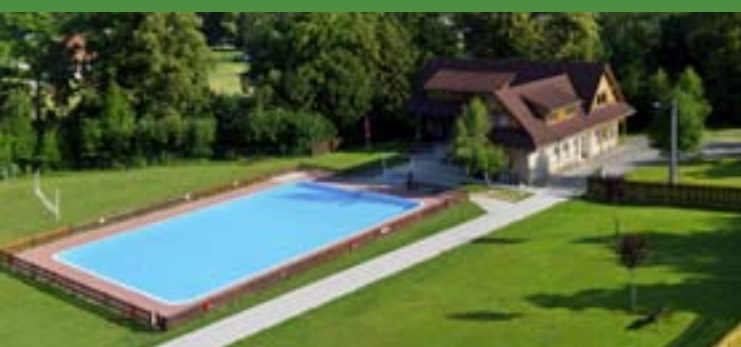
9 - Swimming pool, Vigantice

Zděchov, Velké Karlovice, Vigantice, Hutisko-Solanec, Rožnov pod Radhoštěm and Valašské Meziříčí all have outdoor swimming pools. Dams and river pools can be found in Hovězí, in Bystřička and in Horní Bečva. In Nový Hrozenkov, a fresh water lake is a popular attraction for swimming and water skiing.