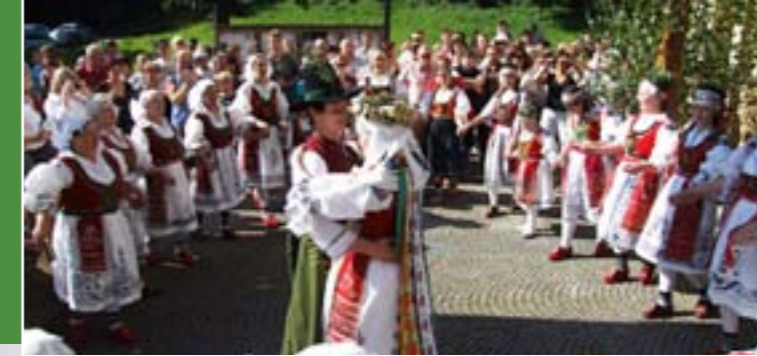
5 - Wallachian Wedding, folklore ensemble Hafera, Nový Hrozenkov

The natural beauty of the countryside and the culture of the local people have inspired many artists to depict Wallachians in paintings, stories, poems and songs. Numerous dancing and singing groups keep Wallachian folklore alive.