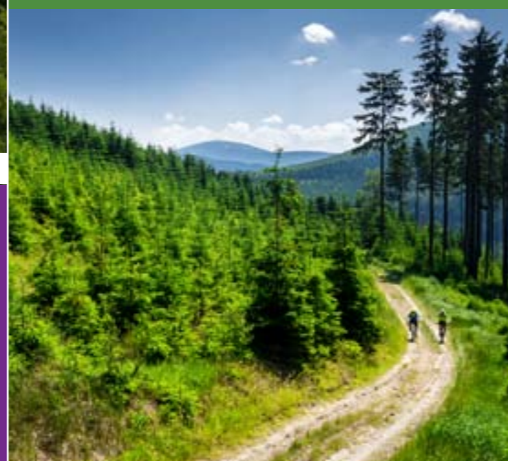
13 - Veřovické vrchy with Mt. Radhošť in the background

A wealth of bicycling and hiking trails wind their ways through the hilly countryside. The most popular areas are Javorníky, Vsetínské vrchy, Veřovické vrchy, Pustevny, Radhošť and Soláň. In Velké Karlovice and Zděchov, bicyclists can try special single track bicycle trails.