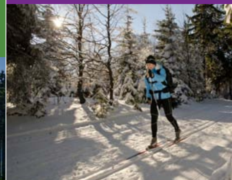
15 - Ski trail on top of the Javorníky mountain ridge

Cyklostezka Bečva, which starts in Vsetín and runs all through the Vsetínská Bečva river valley, is a very popular bicycle trail.