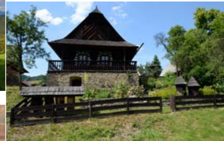
4 - Antonín Strnadel Museum, Nový Hrozenkov

The natural beauty of the countryside and the culture of the local people have inspired many artists to depict Wallachians in paintings, stories, poems and songs. Numerous dancing and singing groups keep Wallachian folklore alive.