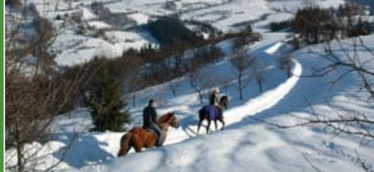
10 - A winter ride

Visitors interested in horseback riding come to Horní Vsacko and Rožnovsko to enjoy special riding programs, which are offered at different venues. At the moment, horseback riding can be enjoyed in Hovězí, Janová, Karolinka, Velké Karlovice, Rožnov pod Radhoštěm, Valašské Meziříčí, Valašská Bystřice, Prostřední Bečva and Horní Bečva.