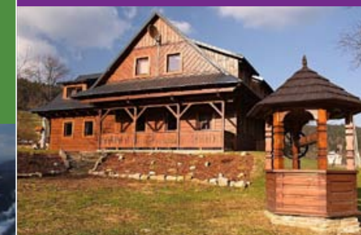
19 - Accommodation in Velké Karlovice

Accommodation services are plentiful and diverse. They include chalets, houses-for-rent and hotels including family pensions or large five star venues. Restaurants and bars typically offer local specialties.