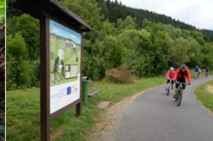
14 - Cyklostezka Bečva bicycle path, Janová

Cyklostezka Bečva, which starts in Vsetín and runs all through the Vsetínská Bečva river valley, is a very popular bicycle trail.