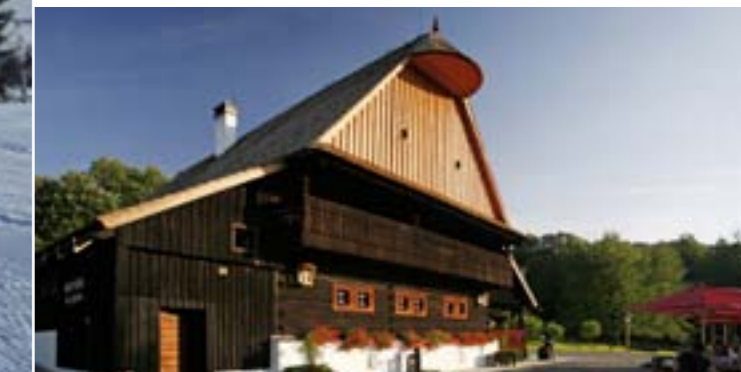
20 - Fojtka, Hutisko-Solanec