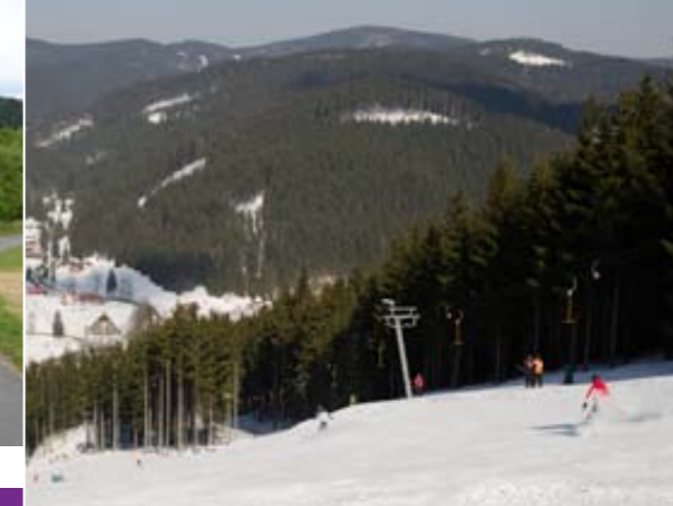
16 - Ski centre Razula

The winter weather in the area is usually favourable for skiing. Cross-country skiers enjoy tens of kilometres of groomed cross-country trails in the valleys of Horní Vsacko and Rožnovsko areas. The centre of cross-country skiing is Velké Karlovice.