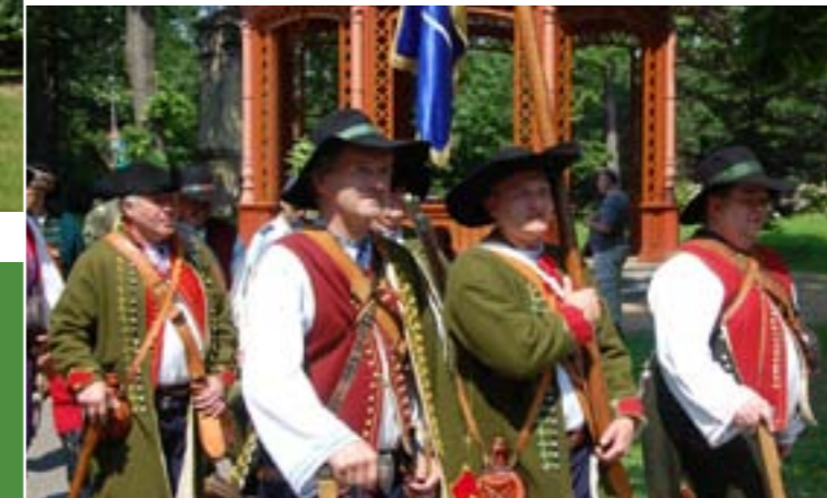
7 - Portáš Festival, Valašská Bystřice

In Rožnovsko and Horní Vsacko seven tourist information centres offer services to visitors. They are located in Karolinka, Nový Hrozenkov, Velké Karlovice, Zašová, Valašská Bystřice and Rožnov pod Radhoštěm.