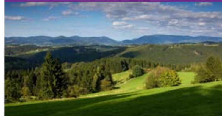
1 - View of Mt. Radhošť (and Velký Javorník) from Valašská Bystřice

The following areas have the status of natural monument or nature preserve: Galovské lúky (Huslenky), Poskla (Hutisko – Solanec), Pod Juráškou (Horní Bečva), Uherská (Zděchov), Stříbrník (Hovězí), Kutaný (Halenkov), Razula (Velké Karlovice), Kudlačena (Horní Bečva) and others.