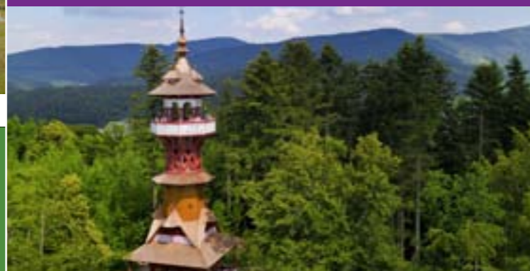
11 - Jurkovič view tower, Rožnov pod Radhoštěm

Visitors interested in horseback riding come to Horní Vsacko and Rožnovsko to enjoy special riding programs, which are offered at different venues. At the moment, horseback riding can be enjoyed in Hovězí, Janová, Karolinka, Velké Karlovice, Rožnov pod Radhoštěm, Valašské Meziříčí, Valašská Bystřice, Prostřední Bečva and Horní Bečva.